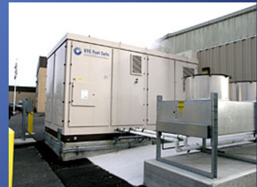
Fairfield - WPCA