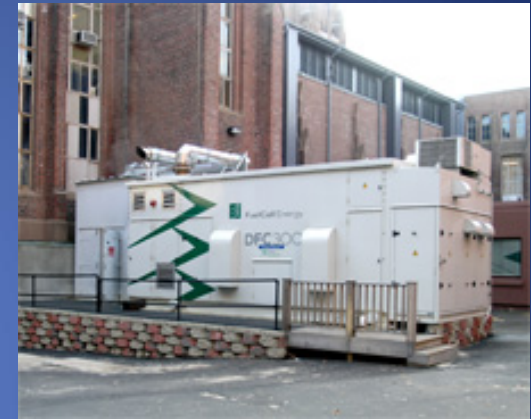
Yale – Peabody Museum